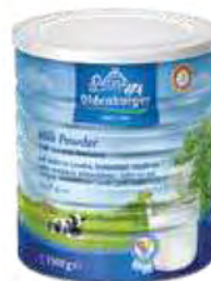
MILK POWDER 2.5 kg PACKING: 6 x 2.5kg