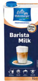
BARISTA MILK PACKING: 12 x 1 LTR