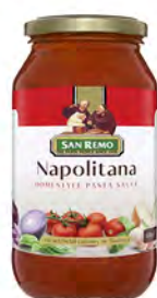
NAPOLITANA PACKING: 12 x 500g