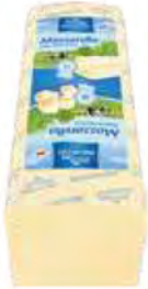
MOZZARELLA PACKING: 4X2.5KG