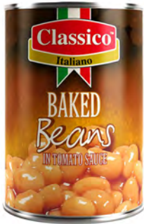
BAKED BEANS PACKING: 24X400G