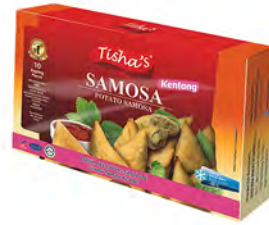
SAMOSA VEG PACKING: 36X250G