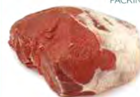
BEEF TOPSIDE PACKING: 20kg