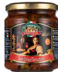
SUN DRIED TOMATOES PACKING: 12X285G