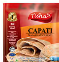
CAPATI PACKING: 18X500G