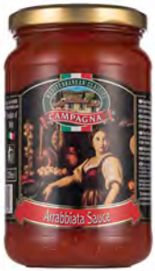
ARRABIATA SAUCE PACKING: 12X350G