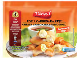
CHEESE CARBONARA PACKING: 36X300g