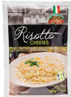
RISOTTO CHEESE PACKING: 12X160G