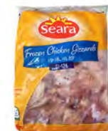
GIZZARDS PACKING: 12X1Kg