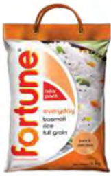
EVERYDAY BASMATI PACKING: 4x5KG 20x1KG