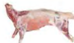
LAMB CARCASS WHOLE PACKING: 15kg approx.