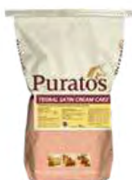
TEGRAL SATIN CREAM CAKE PACKING: 15Kg