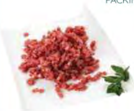
BEEF MINCED PACKING: 40X450g