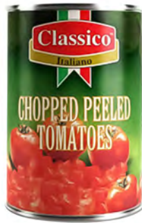
CHOPPED TOMATOES PACKING: 24X400G