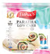
ROTI PARATHA LOW CARB PACKING: 20X390G