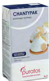
CHANTYPAK - NON DAIRY CREAM (WHIPPING CREAM) PACKING: 12x1Ltr