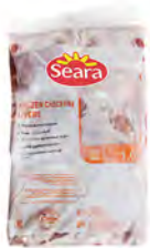
LIVER PACKING: 16X1Kg