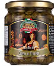
CAPERS IN VINEGAR PACKING: 12X285G