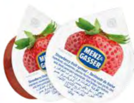
STRAWBERRY PACKING: 200x14g