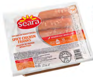
SPICY CHICKEN FRANKS PACKING: 24X340g