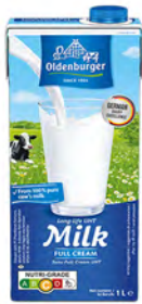
LONG LIFE UHT MILK FULL CREAM 3.5% PACKING: 12 x 1 LTR