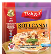
ROTI CANAI PACKING: 24X360G