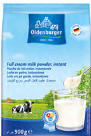
MILK POWDER POUCH PACKING: 12X900G