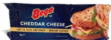
CHEDDAR BLOCK PACKING: 6 x 2kg