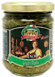
GREEN PESTO PACKING: 12X180G