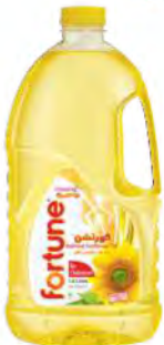
SUNLITE SUNFLOWER OIL PACKING: 6x1.8L