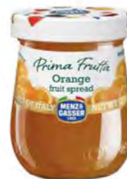
ORANGE PACKING: 12x340g