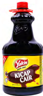
LIGHT SOY SAUCE PACKING: 6X2.2KG