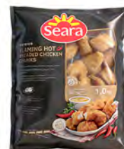
BREADED SPICY CHUNKS PACKING: 10X1KG