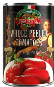
PEELED TOMATOES PACKING: 12X400G