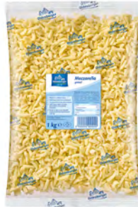
GRATED MOZZARELLA PACKING: 8X1KG