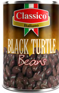
BLACK BEANS PACKING: 24X400G