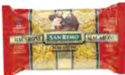
MACARONI #38 PACKING: 12 x 500g