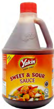
SWEET & SOUR SAUCE PACKING: 6X2.2G