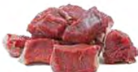
BEEF CHUNKS PACKING: 20x900g