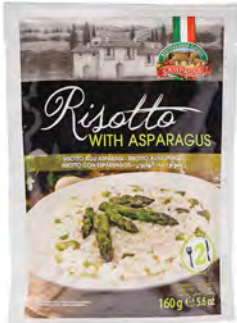
RISOTTO WITH ASPARAGUS PACKING: 12X160G