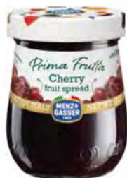
CHERRY PACKING: 12x340g