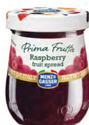
RASPBERRY PACKING: 12x340g