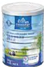
MILK POWDER 900g PACKING: 12 x 900g