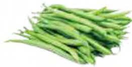
GREEN BEANS PACKING: 4x2.5kg