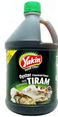
OYSTER FLAVOURED SAUCE PACKING: 6X3.1KG