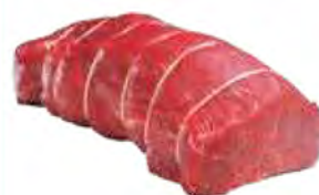
BEEF TENDERLOIN PACKING: 18kg