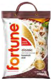
CLASSIC BASMATI PACKING: 4x5KG 20x1KG