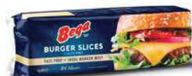
BURGER SLICES PACKING: 12 x 1kg