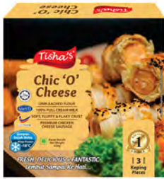
CHICK 'O' CHEESE PACKING: 24X360g