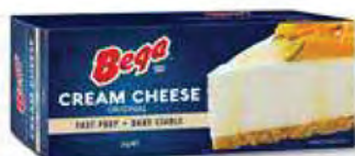
CREAM CHEESE PACKING: 6 X 2kg