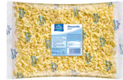
GRATED MOZZARELLA PACKING: 12X500G