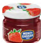
STRAWBERRY PACKING: 48x28g