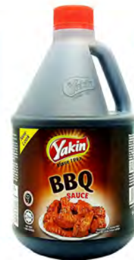
BBO SAUCE PACKING: 6X2.2KG