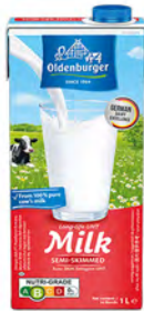
LONG LIFE UHT MILK LOW FAT PACKING: 12 x 1 LTR