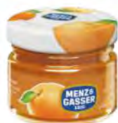
APRICOT PACKING: 48x28g