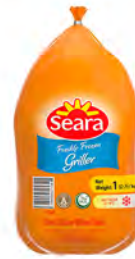
CHICKEN 1000gm PACKING: 10x1000g