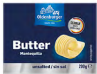
BUTTER 200g PACKING: 20X200G