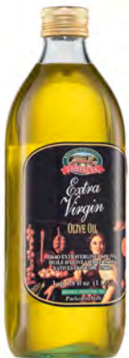
CLEAR EXTRA VIRGIN OLIVE OIL PACKING: 12X1L