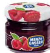
RASPBERRY PACKING: 48x28g