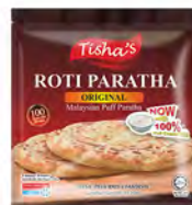
ROTI PARATHA ORIGINAL PACKING: 24X375G