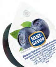
BLUEBERRY PACKING: 200x14g