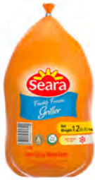
CHICKEN 1200gm PACKING: 10x1200g