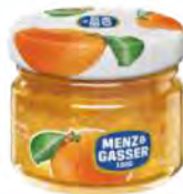
ORANGE PACKING: 48x28g