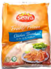
BREAST PACKING: 12X1 6X2KG