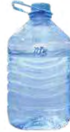
5 Ltr PACKING: 4x5Ltr