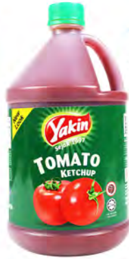
TOMATO KETCHUP PACKING: 6X2.9KG