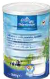
MILK POWDER 1.8 kg PACKING: 6 x 1.8kg