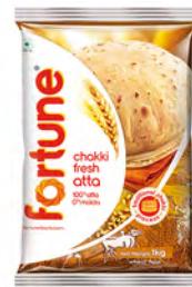
CHAKKI FRESH ATTA PACKING: 10x1KG

Dear Soup, We all know who the true food comforter is. Sincerely, Dal Khichdi