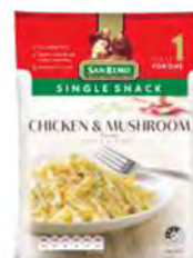
CHICKEN & MUSHROOM PACKING: 12 x 80g