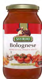
BOLOGNESE & MUSHROOM PACKING: 12 x 500g