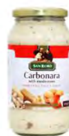
CARBONARA PACKING: 12 x 500g