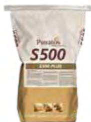
S500 A+ BREAD IMPROVER PACKING: 10kg