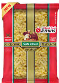
MACARONI PACKING: 12X500G