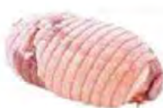
LAMB LEG B/LESS PACKING: 20kg approx.