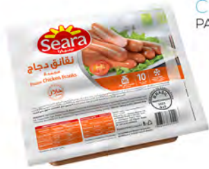
CHICKEN FRANKS PACKING: 28X340g