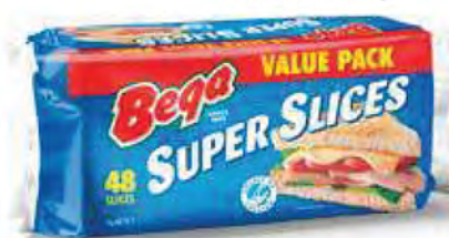
SUPER SLICES PACKING: 6 x 1kg