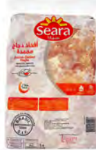
THIGH PACKING: 6x2kg