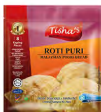
ROTI PURI PACKING: 18X520G