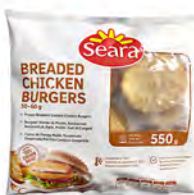
BREADED CHICKEN BURGERS PACKING: 16X550G