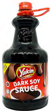
DARK SOY SAUCE PACKING: 6X2.5KG