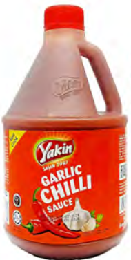
GARLIC CHILLI SAUCE PACKING: 6X2.2KG