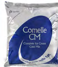
STRAWBERRY PACKING: 6x2.5kg