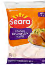
DRUMSTICK PACKING: 12x900gm