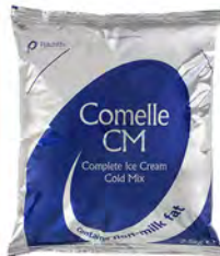
VANILLA PACKING: 6x2.5kg