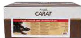
CARAT COVERLUX DARK (COMPOUND) PACKING: 10kg