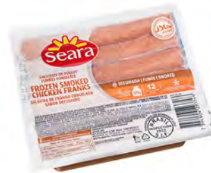
SMOKED CHICKEN FRANKS PACKING: 28X375g