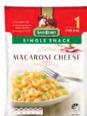
MACARONI CHEESE PACKING: 12 x 80g