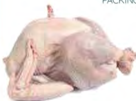
WHOLE TURKEY PACKING: 7-8kg/ pc