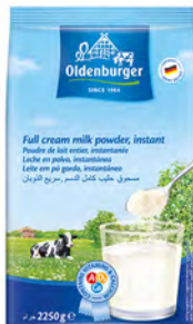
MILK POWDER POUCH PACKING: 6X2.25KG