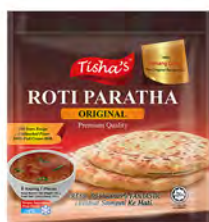
ROTI PARATHA WITH PENANG CURRY PACKING: 24X650G