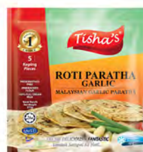
ROTI PARATHA GARLIC PACKING: 24X375G