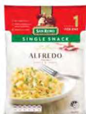
ALFREDO PACKING: 12 x 80g