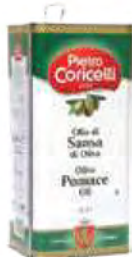
POMACE OLIVE OIL TIN PACKING: 4x5LTR