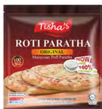
ROTI PARATHA ORIGINAL JUMBO PACKING: 8X1.5KG