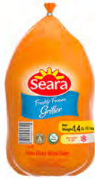
CHICKEN 1400gm PACKING: 10x1400g