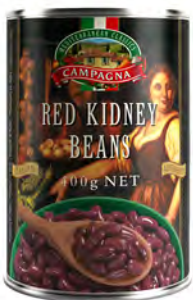
RED KIDNEY BEANS PACKING: 24X400G