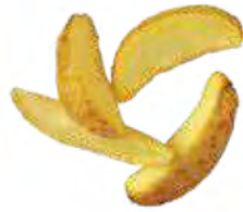
POTATO WEDGES PACKING: 10X1KG