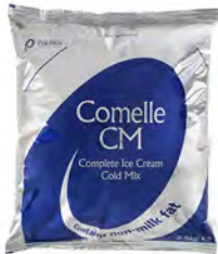
CHOCOLATE PACKING: 6x2.5kg