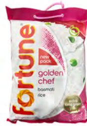
GOLDEN CHEF BASMATI PACKING: 4x5KG