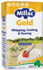
WHIPPING CREAM MILLAC GOLD PACKING: 12x1Ltr