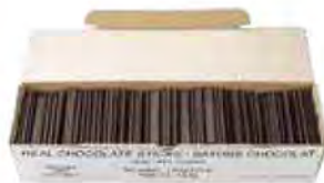
CHOCOLATE STICKS (BAKE STABLE) PACKING: 15x1.6kg