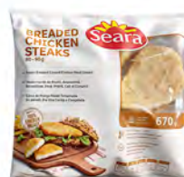
BREADED CHICKEN STEAKS PACKING: 16X670G