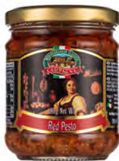
RED PESTO PACKING: 12X180G