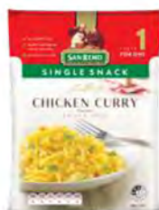
CHICKEN CURRY PACKING: 12 x 80g