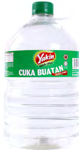
SYNTHETIC VINEGAR PACKING: 6X3KG