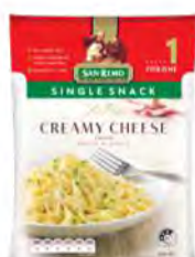
CREAMY CHEESE PACKING: 12 x 80g