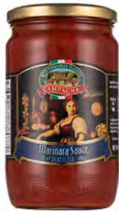
MARINARA SAUCE PACKING: 12X350G