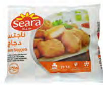
NUGGETS PACKING: 40x300g