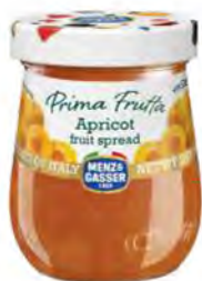
APRICOT PACKING: 12x340g