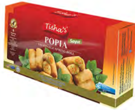
SPRING ROLL VEG PACKING: 36X240G