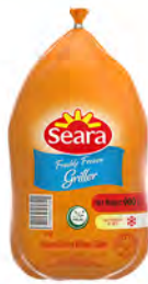
CHICKEN 900gm PACKING: 10x900g