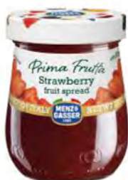
STRAWBERRY PACKING: 12x340g