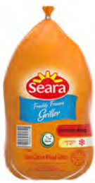
CHICKEN 800gm PACKING: 10x800g