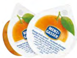
ORANGE PACKING: 200x14g