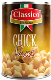
CHICKPEAS PACKING: 24X400G