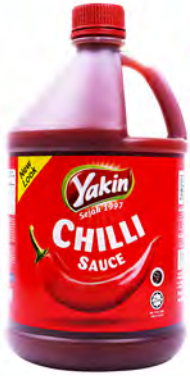
CHILLI SAUCE PACKING: 6X2.9KG