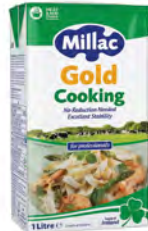
COOKING CREAM PACKING: 12x1Ltr