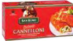
CANNELLONI PACKING: 12 x 250g